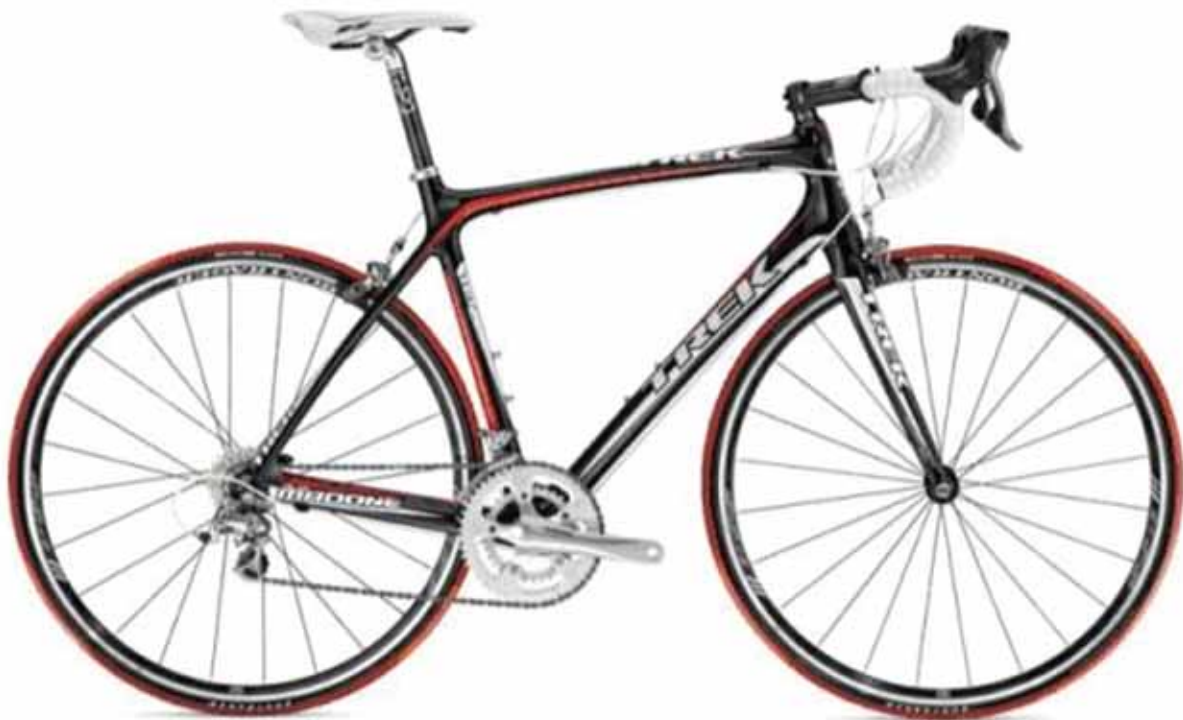
2010 Model Shown